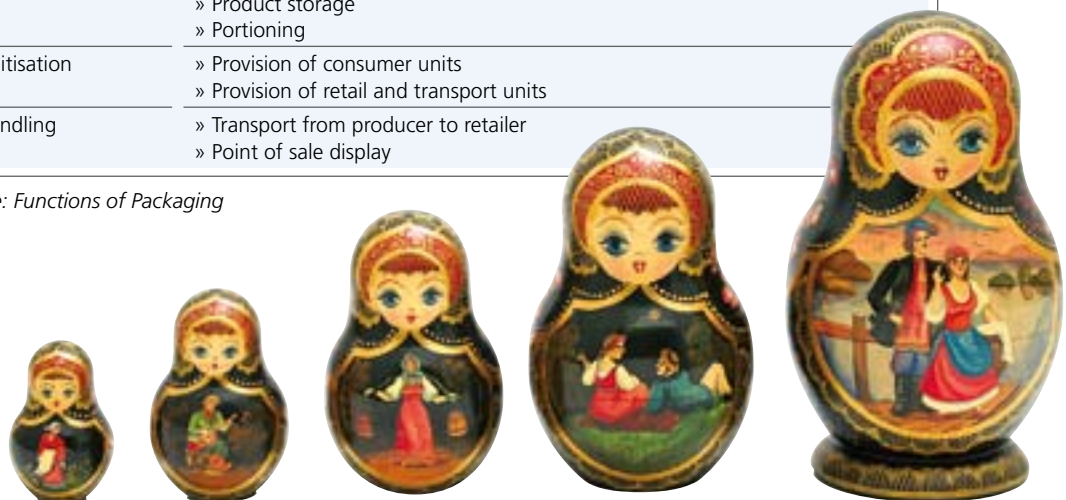
Table: Functions of Packaging