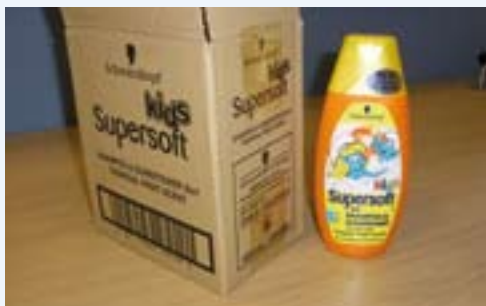
American box solution

In analysing the results the weight given to different impacts is of course subjective and becomes the basis for the discussion with trading partners.